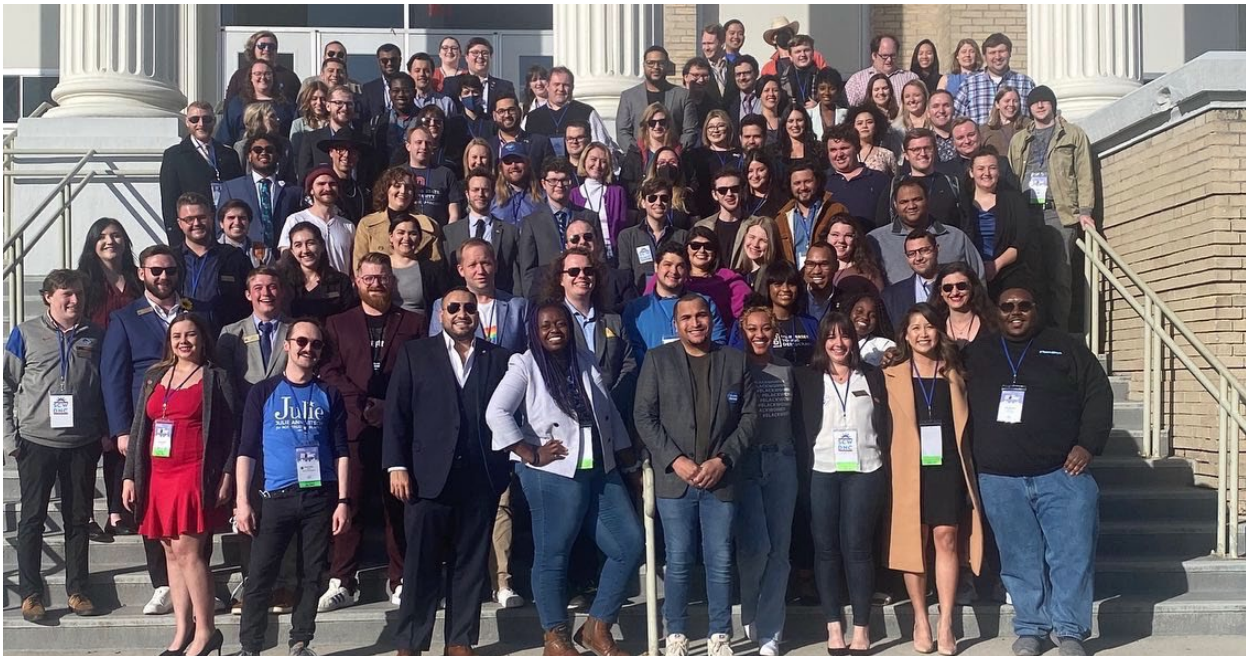
Group Photo from the National Conference and National Committee Meeting in Boise, Idaho during the Spring of 2022

The mission and vision of YDA is to “engage young people across the country to train the next generation of Democratic leaders, elect Democrats, and advocate for progressive issues. The vision of this organization is to be the hub for Democratic youth engagement that cultivates the party leaders of today and tomorrow”