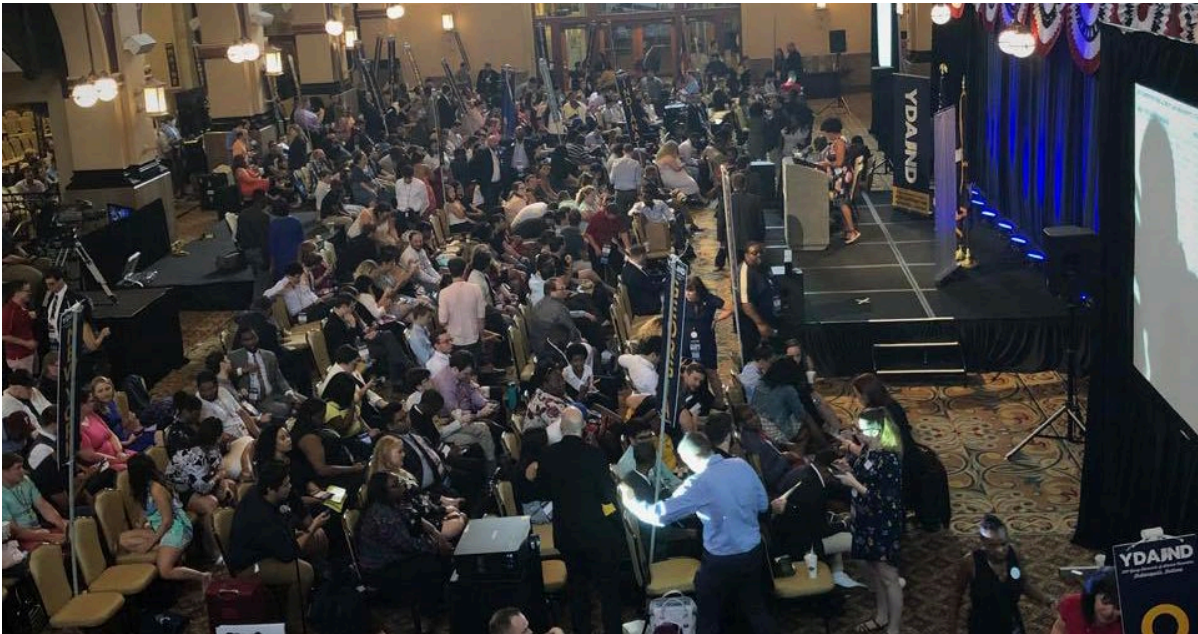
General Session of the 2019 YDA National Convention in Indianapolis, Indiana

The National Convention is planned and ran by the Convention Management Committee who work closely with the Convention Chair, Secretary, Parliamentarian, Sergeant-at-Arms, and the various leaders of the Convention Committees. All these various positions are appointed by the President.