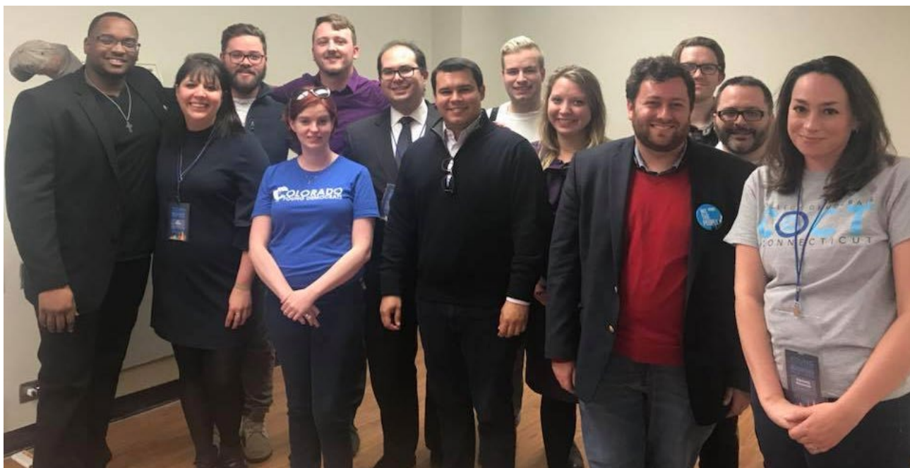
State and territorial Presidents at the conclusion of the January 2018 Association of Chartered Unit Presidents Meeting in New York City, New York

ACUP is comprised of the all the Presidents of states and territories that are chartered with YDA. ACUP elects a Chair, a Vice Chair, and Secretary and at a meeting of the YDA National Committee that takes place after September 1st in odd-numbered years. The Chair of ACUP shall serve as an ex-officio Officer of YDA.