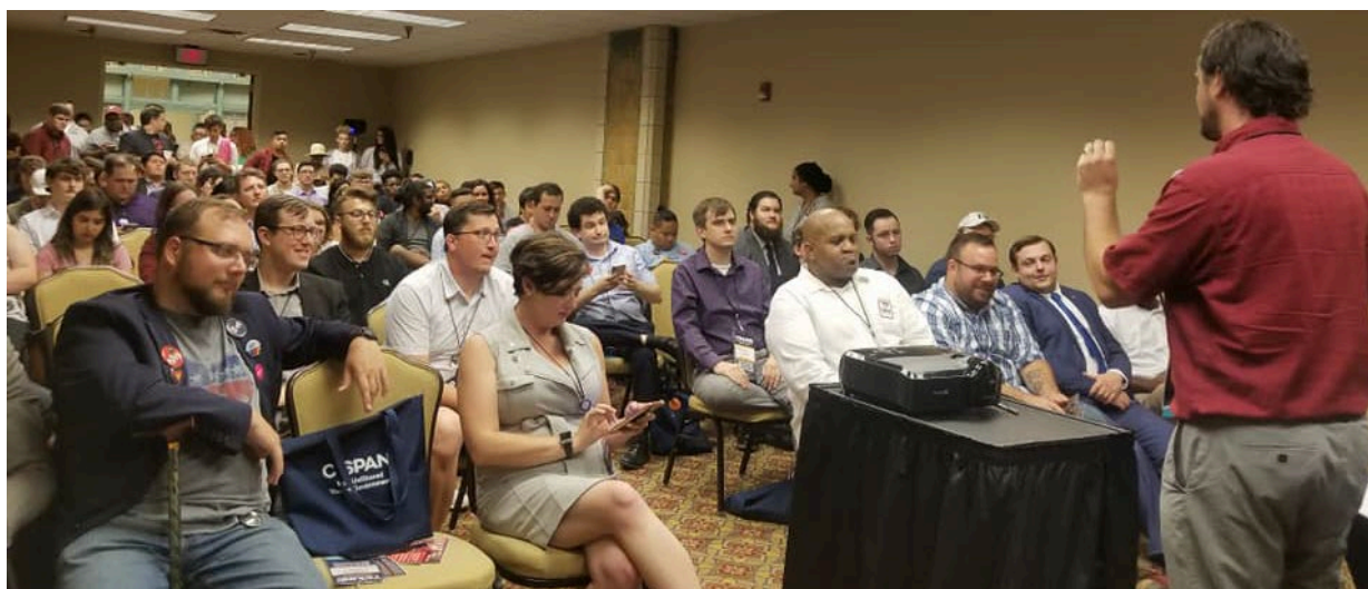
Labor Caucus of the Young Democrats meeting and elections during the 2019 YDA Convention in Indianapolis, Indiana