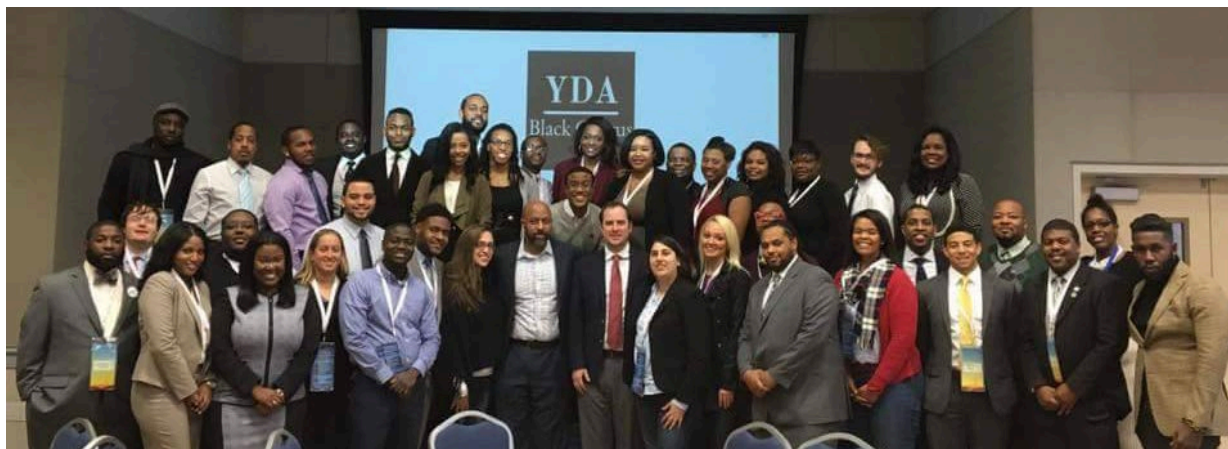
2016 Black Caucus of the Young Democrats of America Progressive Leadership Summit in Washington, D.C.

Hispanic Caucus Veterans Issues Caucus AAPI Caucus Native American Issues Environmental Caucus