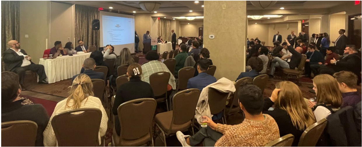
National Conference and National Committee Meeting in Buffalo New York during the Winter of 2022

National Committee is the governing body of the YDA between National Convention; the Committee has broad authority except for powers reserved to the National Convention (e.g., electing officers other than the National Committee Representatives and approving the Platform).